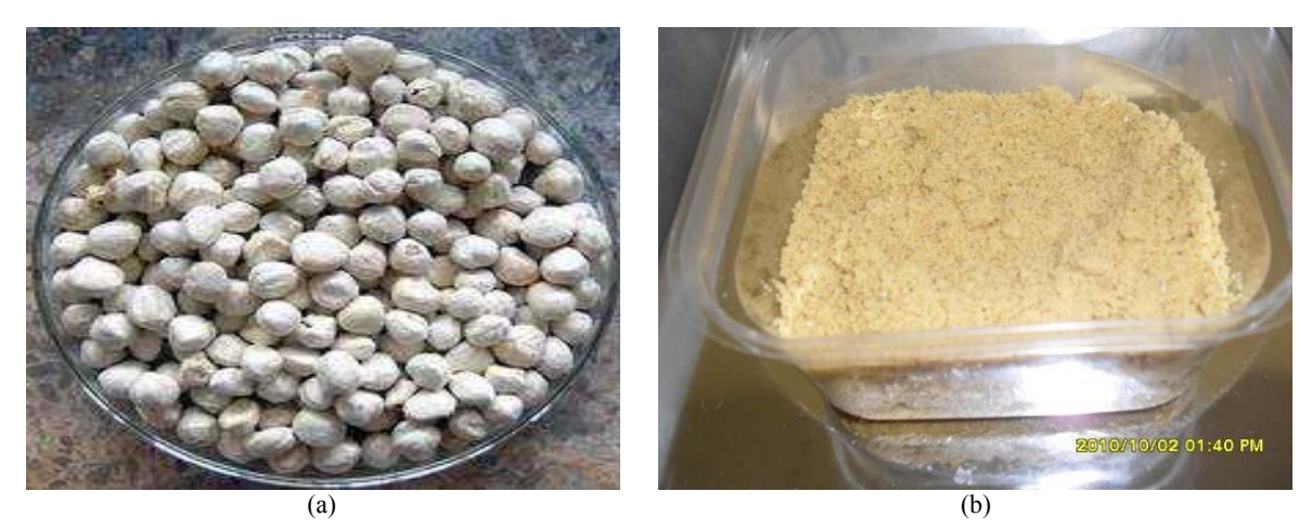
Fig. 1 Moringa (a) fresh dehusked seeds, (b) dried powder, used for the analysis.

455 was monitored (the [M-H]<sup>-</sup> ion for both OA and UA). Although OA and UA showed no significant collision-induced dissociation (CID), the mass spectrometer was still operated in multiple reaction monitoring (MRM) mode, monitoring the "transition" from m/z 455 to 455. The cone voltage and collision energy were 30 V and 15 eV, respectively. The peak area was used to calculate the amount of OA and UA from the standard curve.