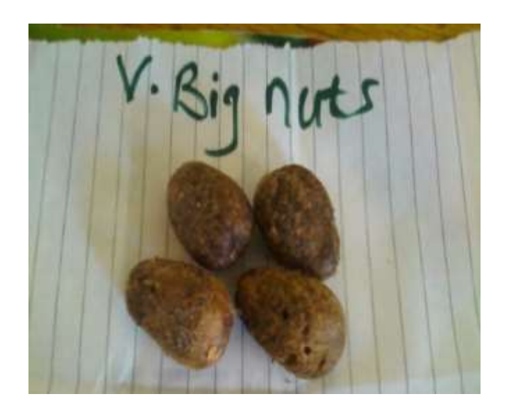
Plate 4. Very big nuts.