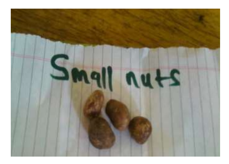
Plate 1. Small nuts.