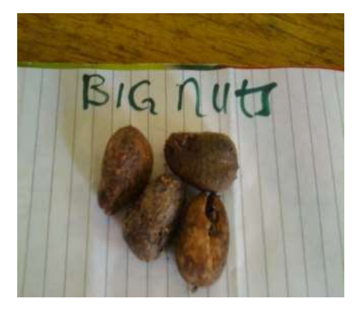
Plate 3. Big nuts.