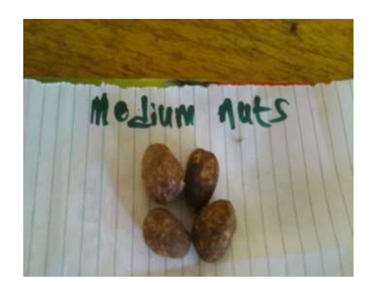
Plate 2. Medium sized nuts.

Snowball sampling was used to select respondents for sensory quality survey on butter colour and texture. Forty (40) women were selected from the Tamale Metropolis for the sensory quality survey on color, texture, taste and aroma.