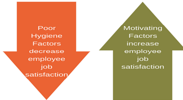
Figure 1.0: Herzberg's Two Factor Theory

Source: Herzberg (1957) motivation and satisfaction theory