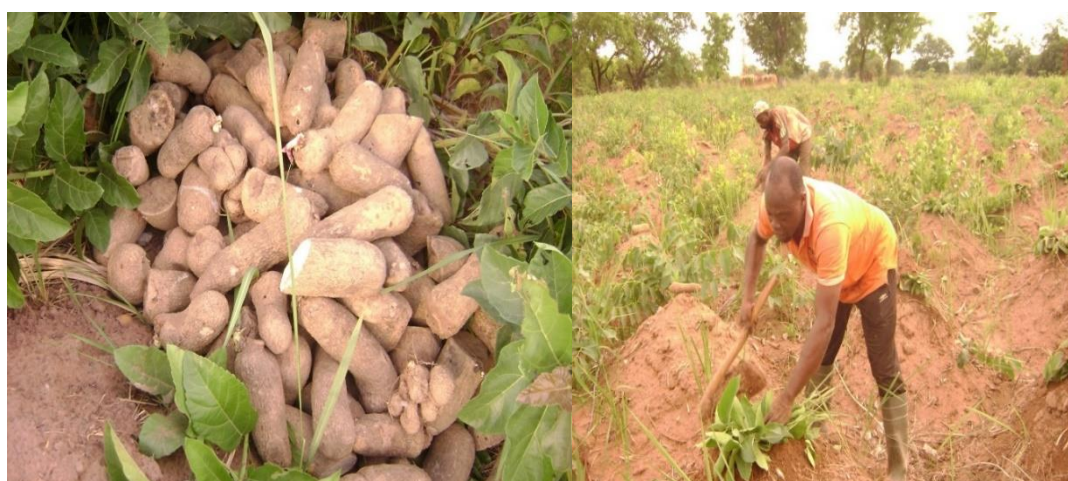
Figure 3. Planting of seed yam at the “Bihigubaani” (BBN) trial site.

Planting (Figure 3) was done in the month of March 2016, before the start of the rains, at a recommended depth of 10 cm below the soil surface and a spacing of 1.2 \times 1.2 m within plots and 2.4 m between plots [14]. Planting was done within a period of three days, taking the weather conditions into consideration to ensure a homogenous planting condition for the three trial sites. There was a day interval between the planting of the first replicate site and the next one. It started from “Bihigubaani”, followed by “Nayilikurugu”, and ended with “Sabdaboya”. Planting was accompanied by capping of the mound with a bundle of grass or leaves as a form of mulch to protect the yam seed from excessive heat of the sun and desiccation.