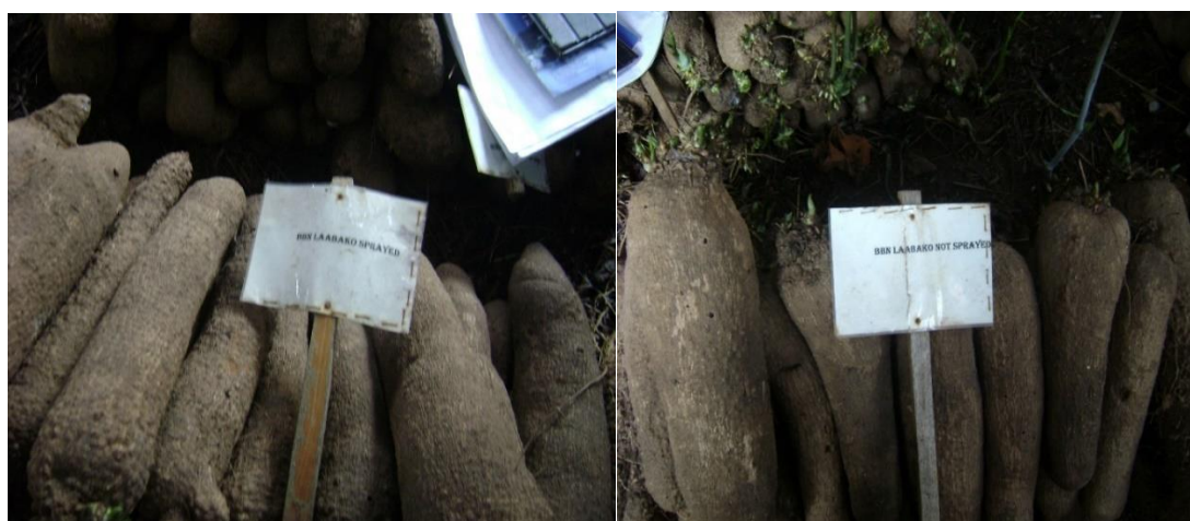
Figure 4. Yam tubers in storage with their labels.

The ware yam was harvested towards the end of January and stored in traditional storage barn until the end of May. The harvesting was done with the use of a hoe and a cutlass and care was taken not to cause unnecessary bruises to the yam tubers, as this could enhance rots during storage [26]. The number of rotten tubers per plot, the number of market quality tubers per plot, and the total weight of market quality tubers per plot were counted as quality assessment parameters. The quality of a tuber was thereafter judged by its size and wholesomeness, i.e., no symptoms of rots, deep cuts, galls, and termite holes. In the storage facility, the yam tubers were placed according to the treatments and controls, with the appropriate labels attached to them (Figure 4). During storage, monthly inspections were done to check the level of rots. During these inspections, rotten tubers in each treatment were removed and counted. At the end of the storage period, counting and weighing were done again to determine the number of rotten tubers and the loss of weight after storage, respectively.